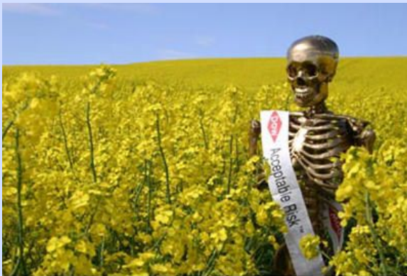
The Yes Men, Acceptable Risk, 2005